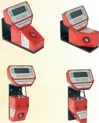
Flexible mounting options of Pro-Test on Bracket, Part No. 62198.BLK9005