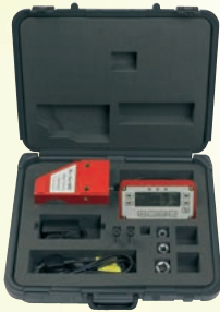
Pro-Test display and transducer in carry case.