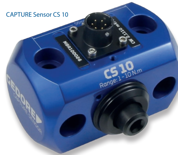
CAPTURE Sensor CS 10

The CAPTURE Sensor is part of the industry-leading CAPTURE system, providing highly accurate torque measurement for Hand and Power Torque Tools.