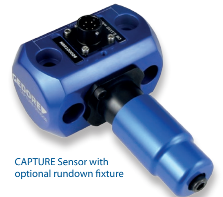
CAPTURE Sensor with optional rundown fixture

Calibrated range: 10% to 100% of capacity