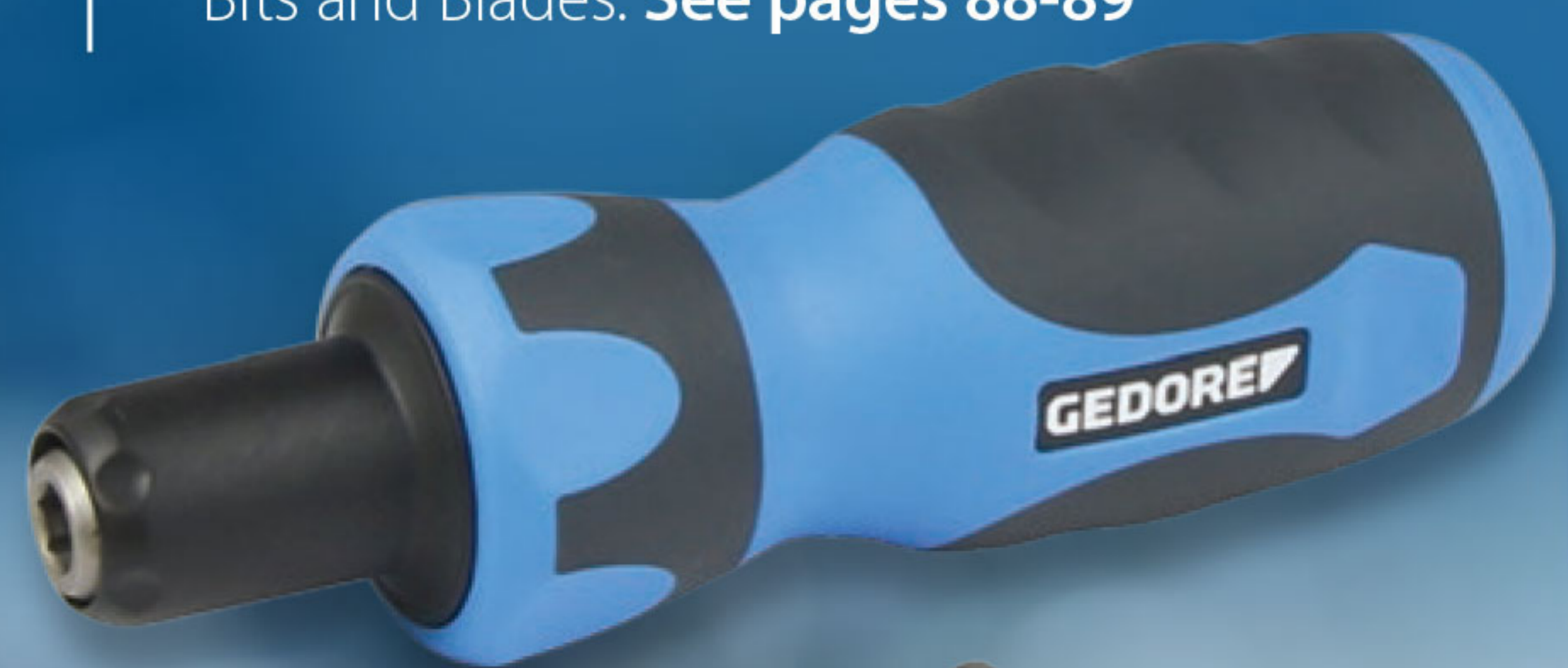
Pro 25 & 150